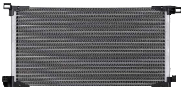
Part No: 30083 Replacement A/C Condenser 2017-21 Toyota Prius Prime 1.8L 4Cyl L