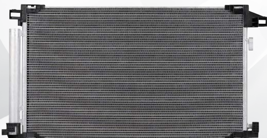
Part No: 30153 Replacement A/C Condenser 2018-20 Toyota C-HR 2.0L 4Cyl L; 2020 Toyota Corolla 1.8L 4Cyl L