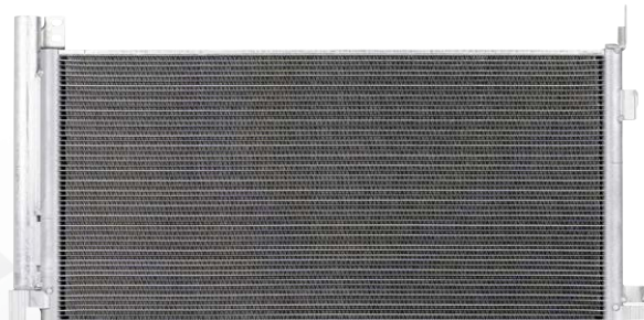
Part No: 30202 Replacement A/C Condenser 2020-21 Toyota Highlander 2.5L 4Cyl L